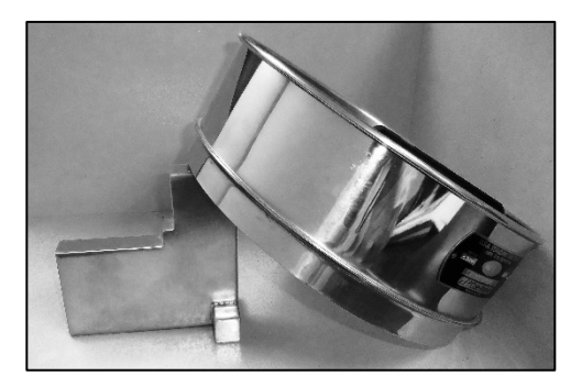
Figure 2-3. Sieve with Tilt Block Set at 30 Degrees.

Method B: Place a sieve on its drain pan. Pour the chitterlings into the sieve and distribute them over the surface of the sieve with a minimum of handling. Hold the sieve firmly and incline it 30 degrees to facilitate drainage, then start the stop watch and drain for exactly two minutes. At the end of the drain time, immediately transfer the drain pan with the purged liquid to the scale for weighing. Dry the empty package to determine its tare weight and enter it in Column C. Determine the purged net weight of the chitterlings using the following formula and record in Column F of the worksheet.