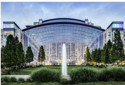
The Quest conference will be held at the Gaylord National Harbor.