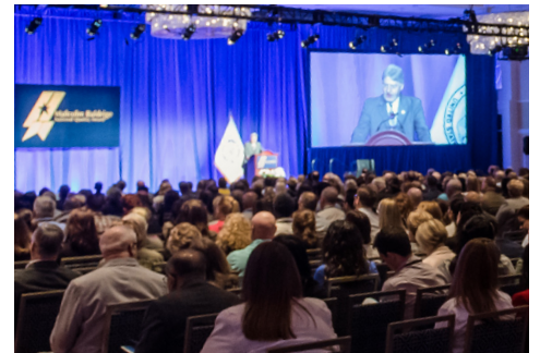
A view of the ballroom from previous Quest conferences.