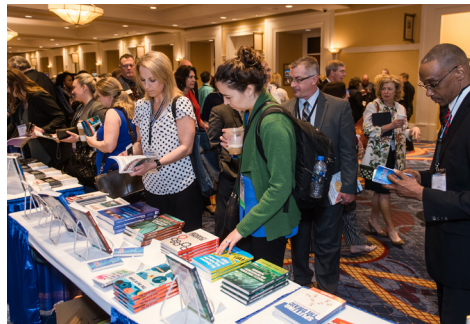
Time scheduled for networking and book signing!