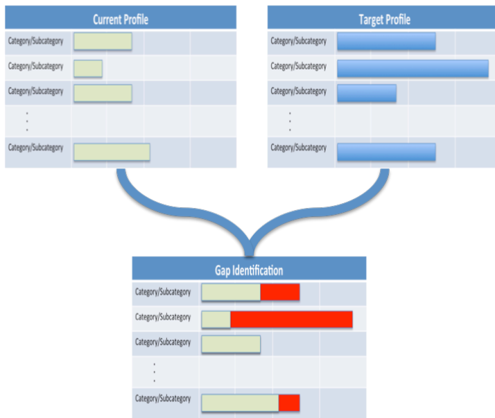
Figure 2: Profile Comparisons

The Profile is the alignment of the Functions, Categories, Subcategories and industry standards with the business requirements, risk tolerance, and resources of the organization. The prioritization of the gaps is driven by the selection of the Framework Tier and organization’s Risk Management Processes which can serve as an essential part for resource and time estimates needed that are critical to prioritization decisions.