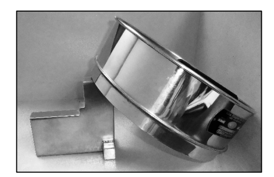
Figure 2-3. Sieve with Tilt Block Set at 30 Degrees.

Method B: Place a sieve on its drain pan. Pour the chitterlings into the sieve and distribute them over the surface of the sieve with a minimum of handling. Hold the sieve firmly and incline it 30 degrees to facilitate drainage, then start the stop watch and drain for exactly two minutes. At the end of the drain time, immediately transfer the drain pan with the purged liquid to the scale for weighing. Dry the empty package to determine its tare weight and enter it in Column C. Determine the purged net weight of the chitterlings using the following formula and record in Column F of the worksheet.