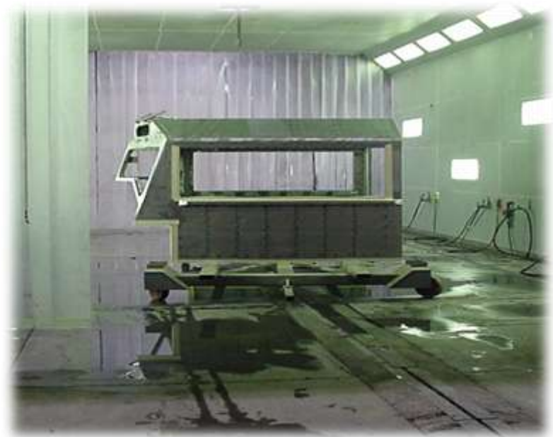
Large Batch In-Line Painting