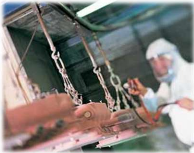
Automated Paint Line