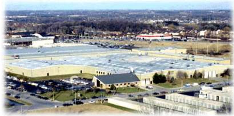
Headquarters: Milwaukee, WI