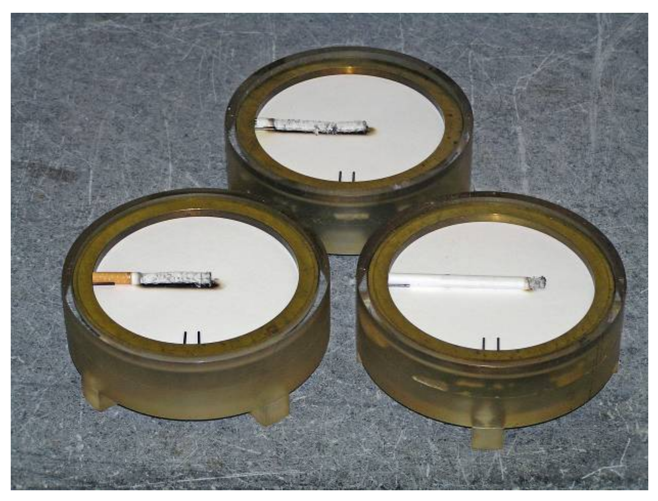
Figure 2. Photograph of Typical Results of Determinations using ASTM E2187-04. Top: full-length burn of the CTC (a non-filter cigarette); Left: full-length burn of a filter tip cigarette; Right: ceased burning of a low ignition strength cigarette.

sink, absorbing energy from the cigarette. A cigarette of high ignition strength continues burning its full length, despite the heat loss to the paper. The coal in a weaker burning cigarette cannot endure the heat loss and continue burning. The result of a single determination is whether the cigarette burns its full length or not. Typical results are shown in Figure 2.