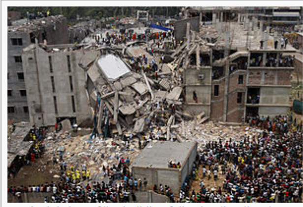
Aerial view of the building following the disaste