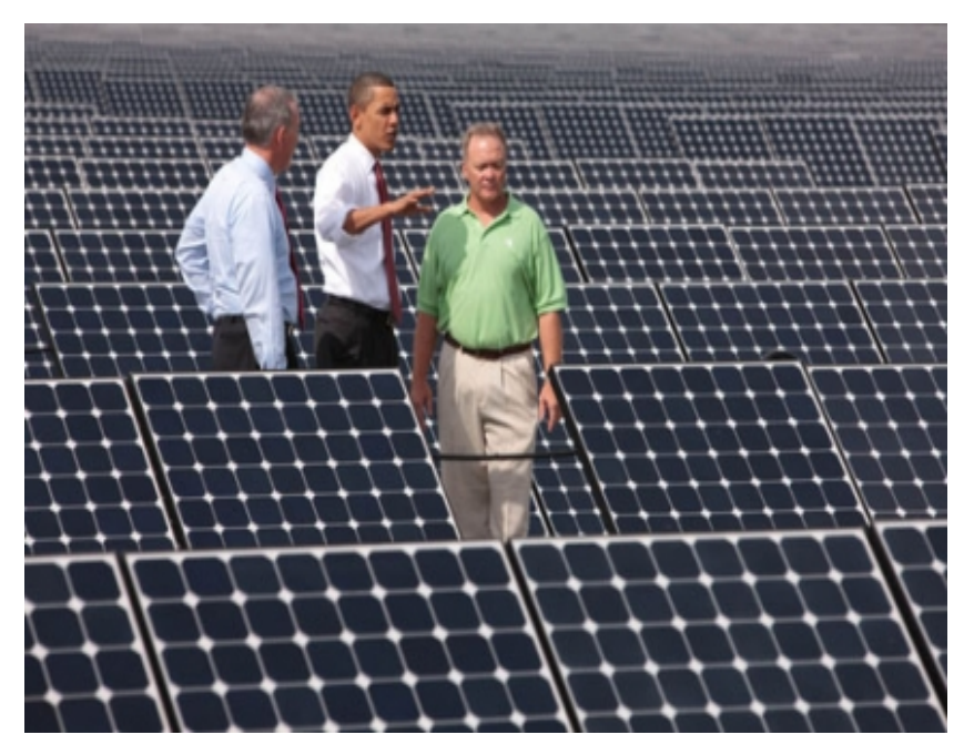
President Obama, October 27, 2009, at the DeSoto Next Generation Solar Energy Center, Announcing the Smart Grid Investment Grant Awards