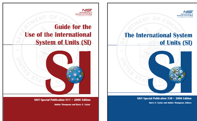
Figure 1. NIST SP811 and SP330 - Key Technical SI Resources

Congress has assigned the responsibility to interpret or modify the SI (International System of Units) for use in the United States to the Secretary of Commerce. This responsibility has been delegated by the Secretary to NIST. To accomplish this mission, NIST