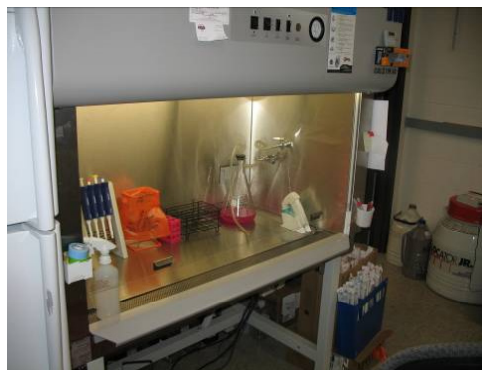
A laminar flow hood used to handle biological samples without risking contamination by microorganisms in the air.

Our cell culture laboratory contains all of the features needed for maintaining cell lines and handling biological tissue samples: laminar flow hood, refrigerator, low temperature freezer, cryogenic storage, incubators, centrifuge, plate reader, optical microscopes, etc. Several cell lines have been established including fibroblasts, adrenal cells, and vascular smooth muscle cells, among many others.