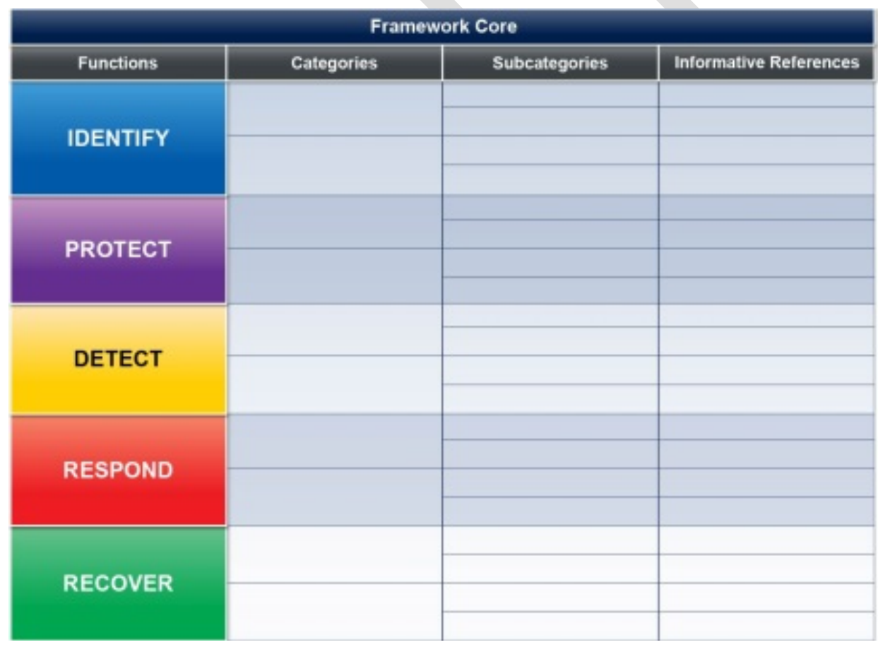
Figure 1: Framework Core Structure