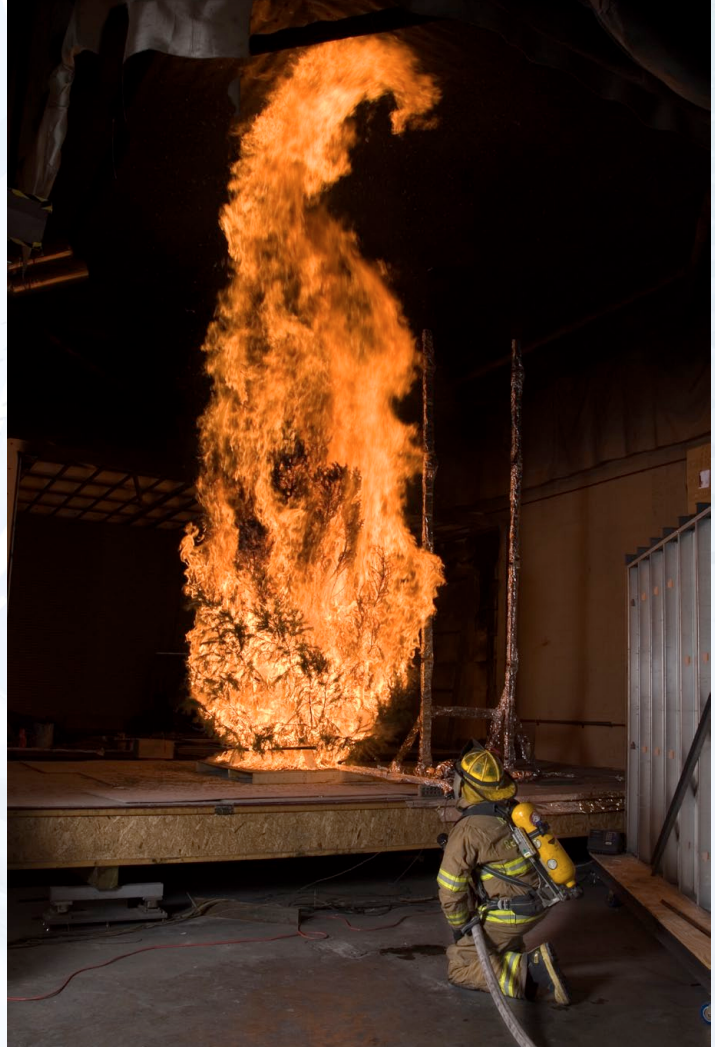
Controlled experiment at NIST's National Fire Research Laboratory yields data that inform approaches to preventing and fighting fires at the wildland-urban interface.

For example, results of fire research have led to standards for children's sleepwear, automatic sprinklers, reduced-ignition-propensity cigarettes, modernized building codes, and computer models that can predict the behavior of fire, smoke and toxic products.Since the early 1980s, the number of fires has been cut by