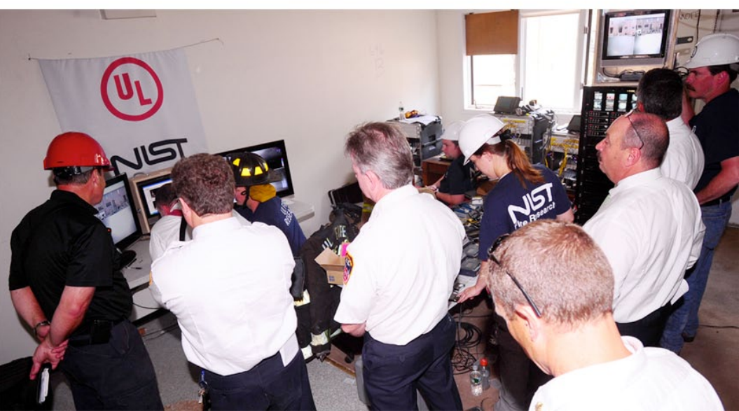
The New York City Fire Department, NIST and Underwriters Laboratories set fire to 20 abandoned townhouses on Governors Island, New York, in a series of experiments to test the conventional wisdom on, and new tactics for, controlling fires and rescuing occupants inside burning homes.