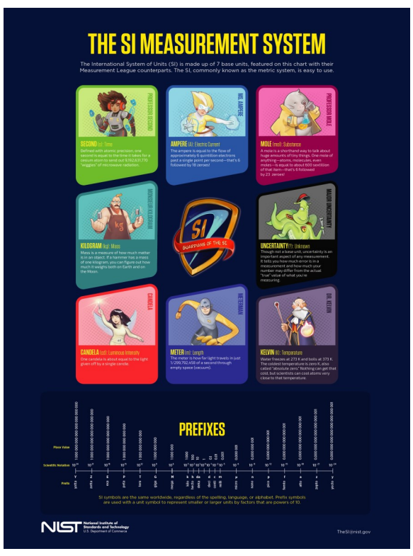
Figure 1. The SI Measurement System poster.

Whether you're hosting a hands-on activity or daily outreach events this year, let us share in your success! When promoting your event or posting photos afterwards, tag us (@nist) on social media with the hashtag #MetricWeek.