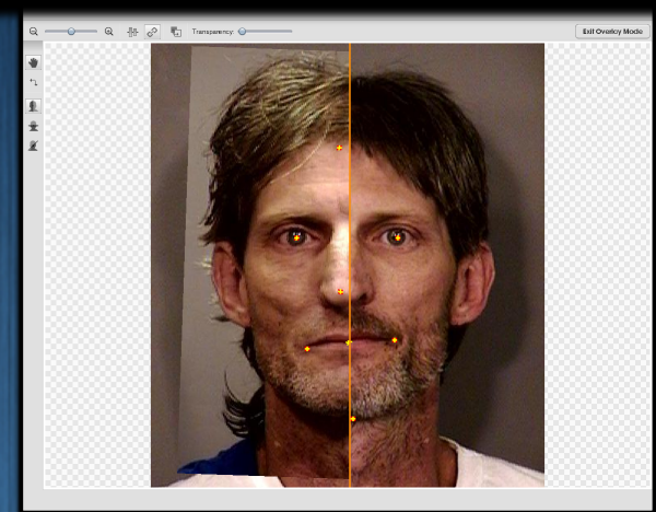
Available for authorized law enforcement use.