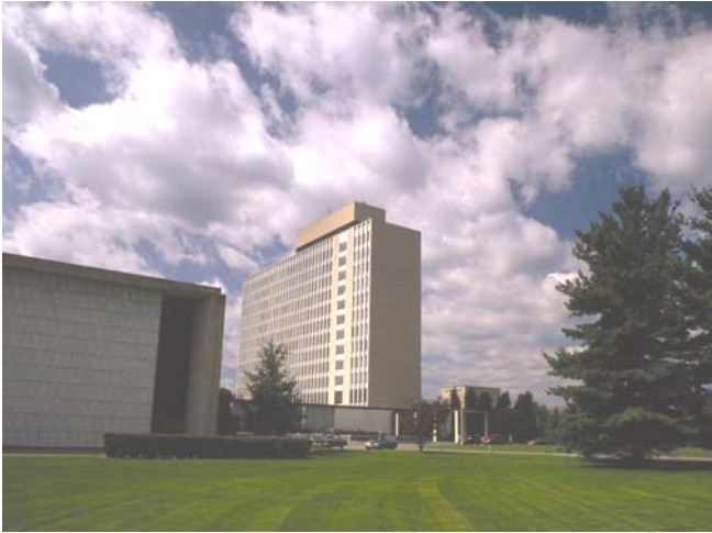
NIST Gaithersburg, Maryland