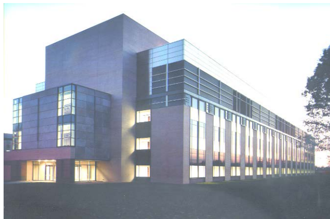
Advanced Chemical Sciences Laboratory