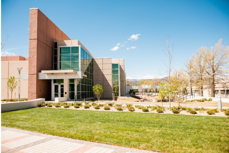
NIST Boulder Laboratories Precision Measurements Laboratory (circa 2013)