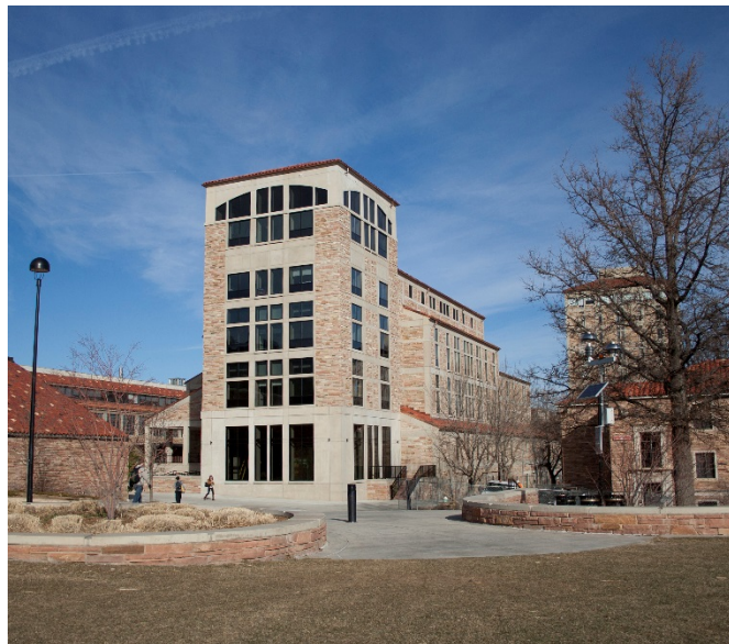
JILA - University of Colorado X-Wing Building (circa 2012)