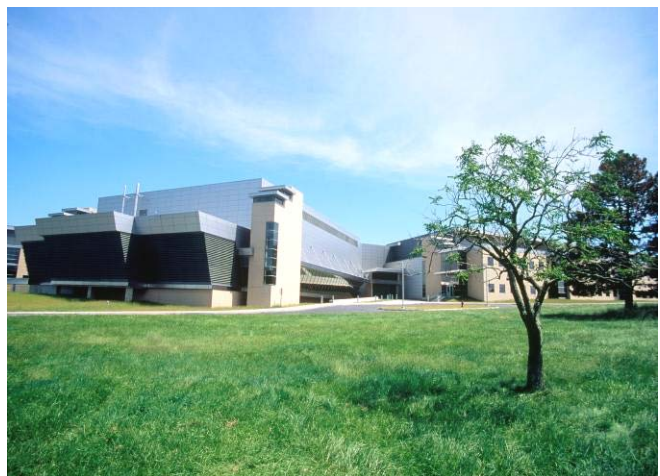
Advanced Measurement Laboratory