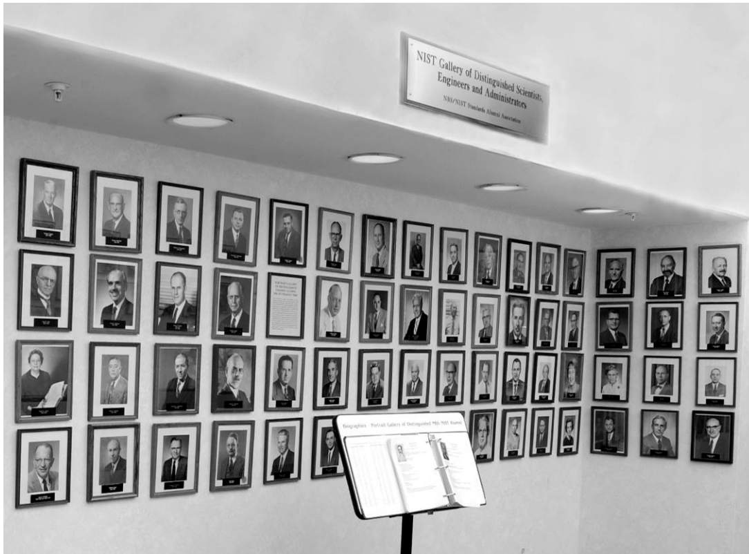
Portrait Gallery photographs in the alcove before the transition to the Digital Portrait Gallery. Most portraits have been moved to the other side of the hall. In the alcove currently is a touch screen digital display.