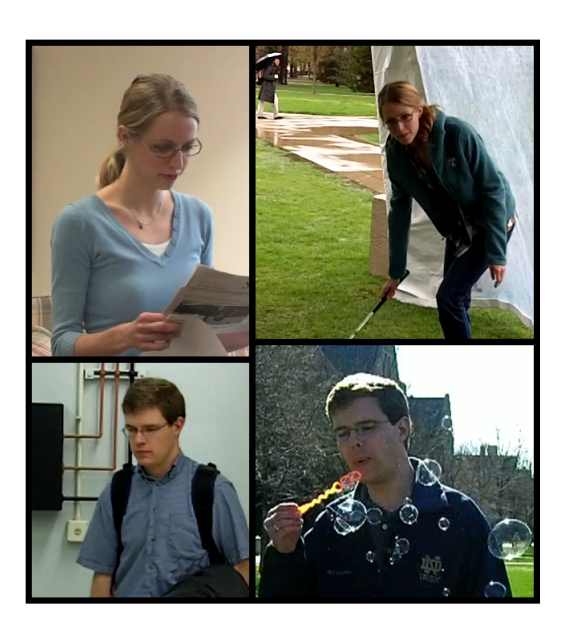
Fig. 1. Clips of two people sampled from four PaSC handheld videos: files 06599d91.mp4, 06599d451.mp4, 05450d1359.mp4 and 05450d1759.mp4.

covariates are reported for each participant. The covariates include properties of the faces such as size, the locations and sensors used to acquire videos, and properties of the subjects such as gender and race. The dominant factor influencing performance is the combination of locations, actions and sensors, indicating verification rates more than double when going from the most to the least challenging environments.