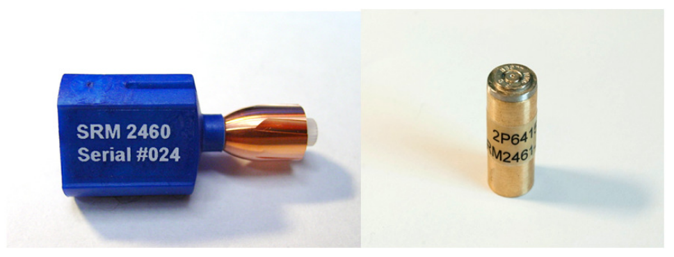
Fig. 1. A SRM 2460 Standard Bullet (left) and a SRM 2461 Standard Cartridge Case (right).

quantitative representation of image similarities; however, both the definitions and algorithms for the correlation scores were proprietary without an objective open test. Moreover, ballistics examiners needed a standard object for testing of different correlation systems for quality assurance, especially when these systems were integrated into a national network.