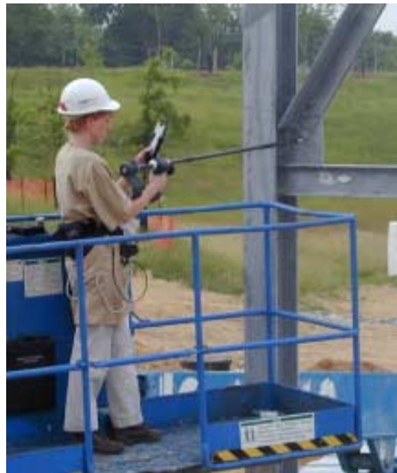
Figure 2. Field operator collecting fiducial point coordinate data with the Vulcan receiving tool integrated with the VIA belt-wearable computer and bar code scanner. A manlift was used to facilitate data collection once the steel tower was erected and installed is its final location.

The entire web-based user interface runs through an Internet Explorer 4.1 graphical user interface written in Microsoft FrontPage98, driven by VisualBasic Scripts. Active Server Pages interact with the project database, and a LiveView [5] Common Gateway Interfaces (CGI) script provides the protocol for the transmission of both the part ID and its coordinates to the part locator service for position and orientation determination.