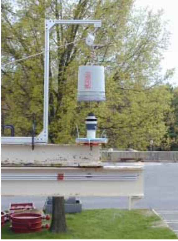
Figure 5. A pulley system and a long power cord allows the field inspector at ground level, approximately 12 m below, to lift the weatherproof cover and attach a rechargeable battery to begin using the transmitter for measurements.