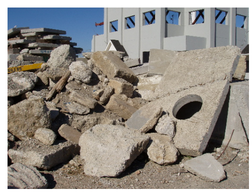
Figure 4: Rubble Pile that Robots Might have to Traverse

For this development effort, we examine a subset of the requirements and attempt to restructure them to facilitate the ontology implementation. We also apply engineering disciplines to attempt to explore further details of Requirements. Table 1 illustrates our analysis effort, with the left column stating a subset of the Requirements and the right column listing the robotic functions or subsystems that are involved to fulfill the requirements. The intent is to organize the robotic knowledge through the ontology.