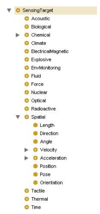
Figure 6: Ontological Model for Sensing Targets