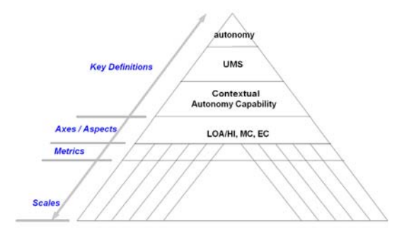
Figure 3: ALFUS Framework Structure

The MC metrics correspond to, among other aspects, the accuracy and repeatability aspects of a goal. The EC metrics correspond to the spatial and temporal aspects of the goal statement. Human interaction may be critical in assisting the robot to reach a safe state or to reach the goal.