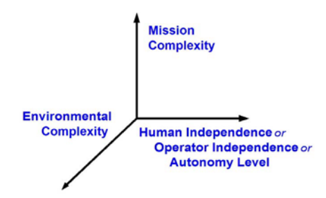
Figure 2: The ALFUS Framework

The ALFUS Framework was developed originally by the ad hoc ALFUS Working Group (WG) that was lead by NIST. The group has later joined the Society for Automotive Engineers (SAE), a standards development organization, as the UMS Performance Measures Subcommittee.